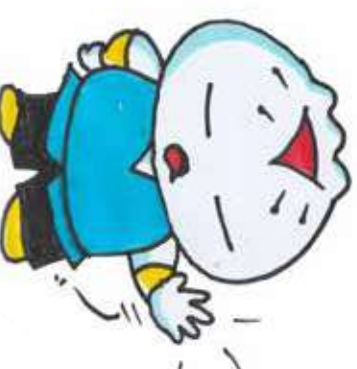
Reject 拒绝 | 拒絕 jùjué