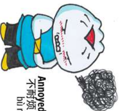
Annoyed/Irritated 不耐烦 | 不耐煩 bù nàifán