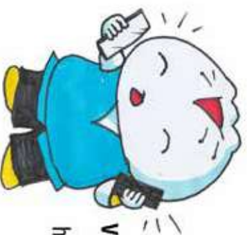
Very Busy 很忙 hěn máng