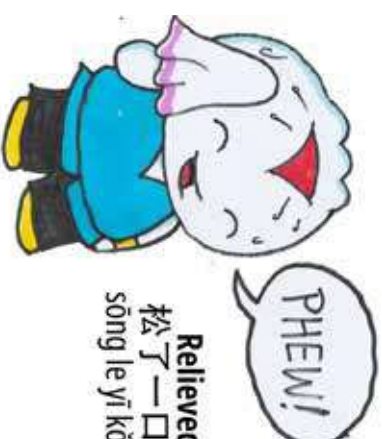
Relieved 松了一口气 sōng le yī kǒu qì