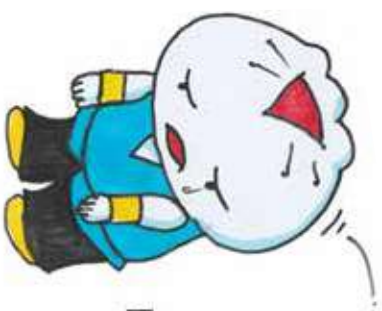
Disappointed 失望 shīwàng